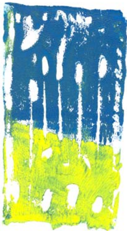
Artwork created by clients in our Rochester, NH facility.