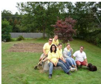
Employees from the Sheraton Hotel volunteer for the United Way Day of Caring & create a garden at Bunker Lane.