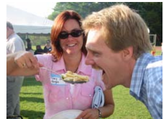
First Annual Employee Outing

When I reflect on the past year, I do so with pride-for our organization, the people we serve, and our employees. We are moving forward in a changing world, and we do so with an unwavering commitment to our mission.