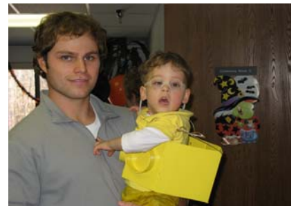
Early Supports & Services trick or treat at Crosby Road administrative offices.

The agency will provide staff with opportunities for professional growth so they may contribute to the overall achievement of the agency's mission.