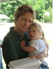
Sharing a special moment at the Annual Developmental Services Summer Outing at The Works.

Community Partners Suite One, Forum Court 113 Crosby Road Dover, NH 03820