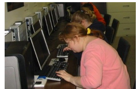
The Newsletter Committee of the Dover Vocational Office works diligently on their latest edition. The computer lab was made possible with funding from New Hampshire Charitable Foundation-Piscataqua and TD Banknorth Charitable Foundation.